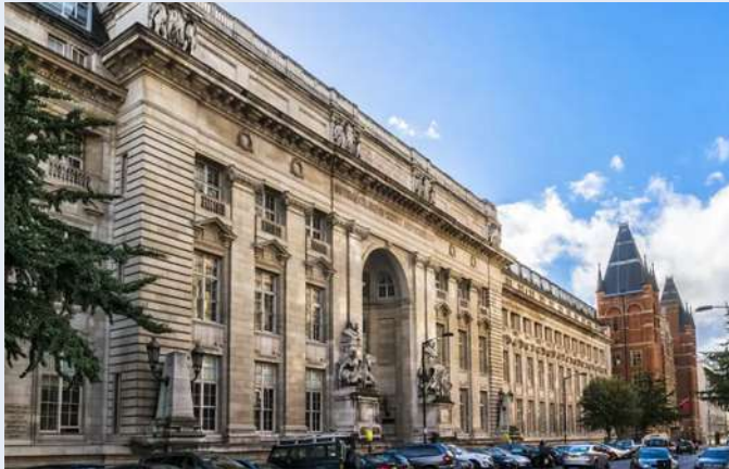
Imperial College London

For the past seven years her role has been to organise the Open Age programme of activities in Hammersmith & Fulham, setting up sessions in a variety of community venues. These can include monthly science talks arranged with Imperial College, delivered via the internet on Zoom, plus theatre and dance, art classes, and more.