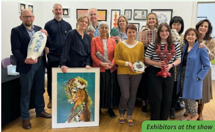
Exhibitors at the show