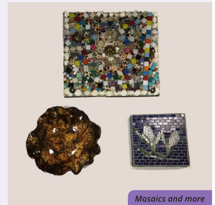
Mosaics and more