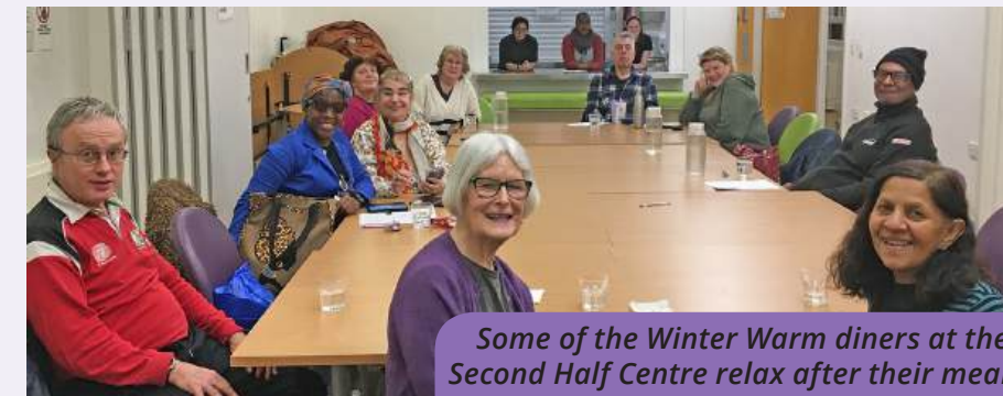
Some of the Winter Warm diners at the Second Half Centre relax after their meal

Anyone who enjoys TV quizzes like The Chase , Eggheads , Tipping Point or Who Wants To Be a Millionaire? may think this sounds like a walk in the park, but not all the questions were easy, so you could have found yourself (university) challenged!