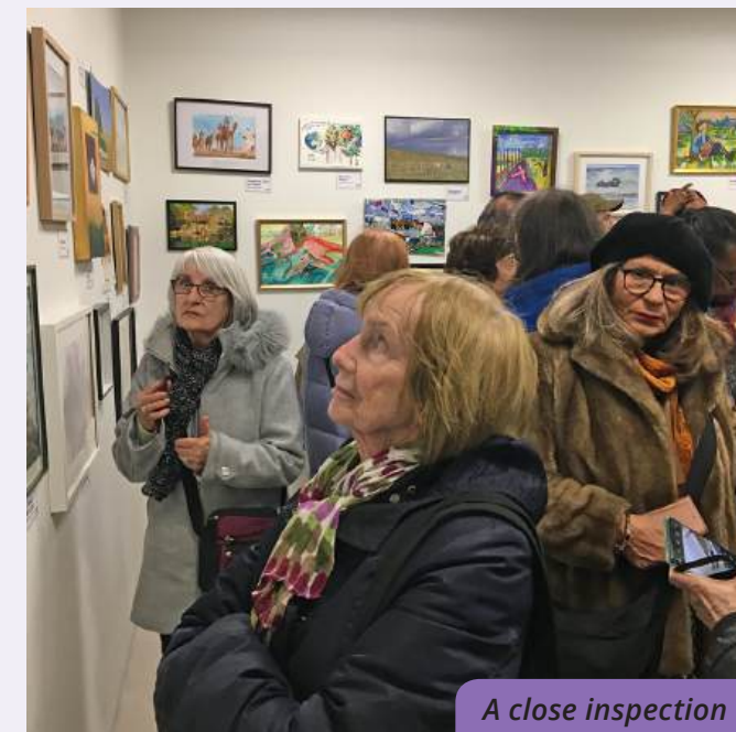
A close inspection

Participants crowded into the small exhibition room on the open day, 23rd April—St George's Day—to see how their art looked on display, but non-exhibitors could visit the show for free on four later days.