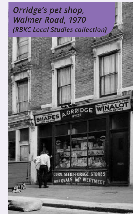
Orridge's pet shop, Walmer Road, 1970

Kensington Histories , which contains dozens of memories and photos provided by residents and uploaded by Sue.