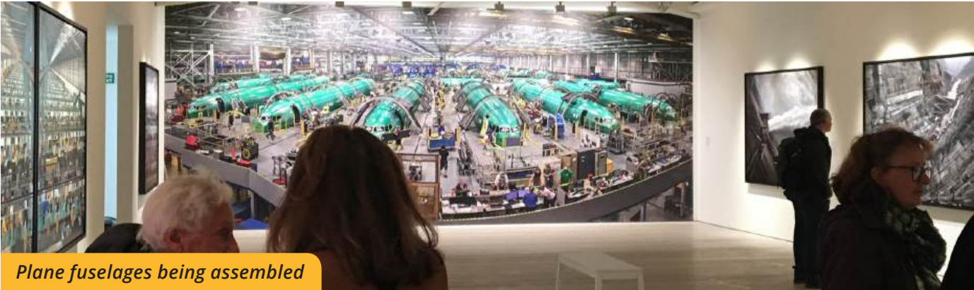
Plane fuselages being assembled

Using the environment idea as a springboard, Open Age members produced their own work in various media. A few of the contributions are featured on page 9. For other stories, see the list below (Inside this issue)